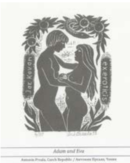
Slide 7 Antonin Prsala, exlibris, (Check Republic)