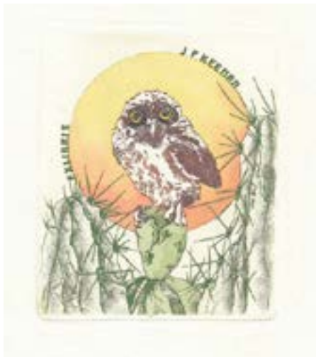
Slide 8 Elly de Koster, exlibris, (Holland)