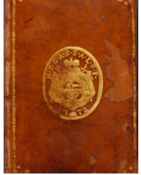
Image 5: First name and surname of the first name is written in the supralibros