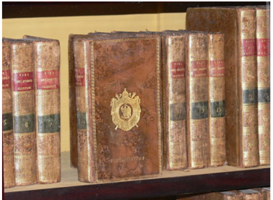
Image 2: Book with supralibros from the Library of Napoleon Bonaparte