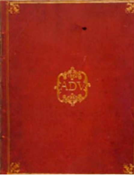
Image 3: Supralibros composed of first letters of first name surname