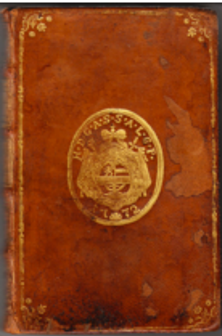
Image 1: Book with supralibros with the arms of 1772 Salzburg Archbishop Kont Hieronymus von Colloredo