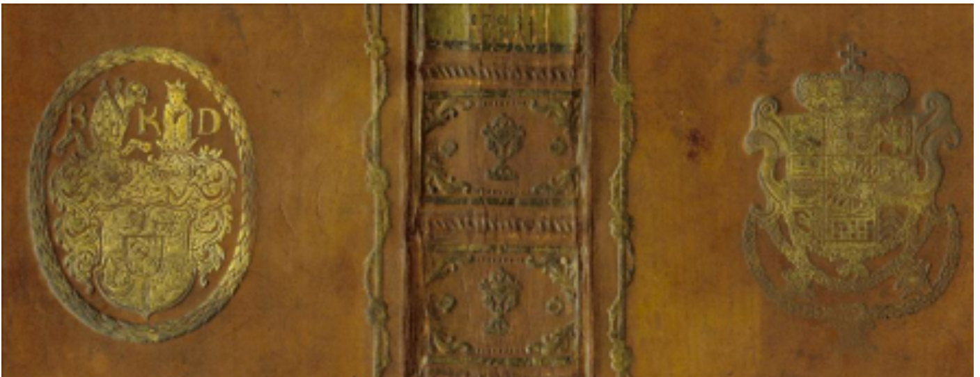
Image 6: Supralibros applied on book front cover, back cover and back

Supralibros collections are mostly expanded through purchases without any swapping involved. The largest known collection of supralibros is Danish collector Ejgil Jenssen Tusche's collection of Swedish supralibros. While collecting ex-libris, particularly supralibros, by means of removing it from the book is not ideal, this is a situation that cannot be avoided today (Rödel, 2002:19).