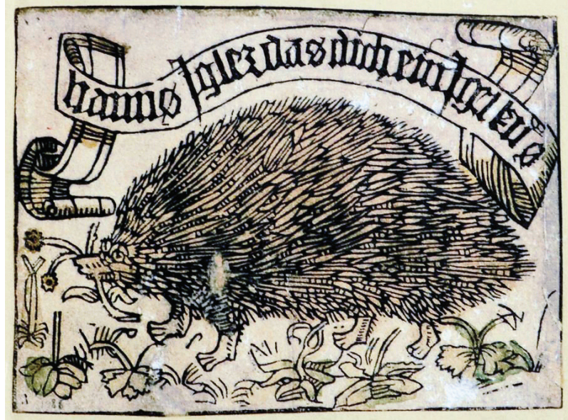
Image 3: A view from the ex-libris designed for Hans Igler around 1450's, 140x190mm.

Igel kuss", placed in a band drawn on the empty space at the top of the design.