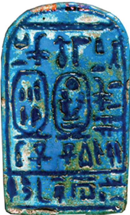
Image 2: A view from the ex-libris designed for the library of Amenhotep III applied to tile surface around 1400 BC (62 x 38 x 4,5 mm)