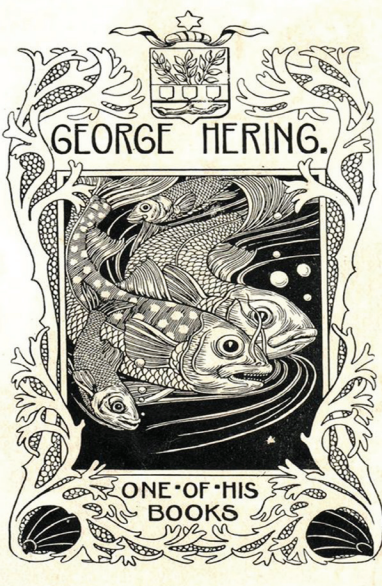
Image 1: A view from the ex-libris designed for George Hering bearing the writing “one of his books” instead of “ex-libris”

While the word “ex-libris” is written before or after the name of the person for whom it is designed or elsewhere in the design usually in accordance with the visual data in the design or with the original approach of the designer, it is also possible to encounter exceptional practices in this context. For instance in the work designed on behalf of George Hering