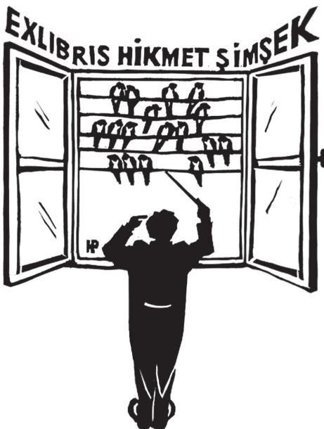
Image 5: A view from the ex-libris designed for the library of Hikmet Şimşek by Hasip Pektaş, X5, 100x75mm, 1997

Regarding the data required for examination, the basic indicators of the