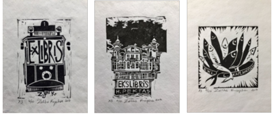
Image 6-7-8: Ex-libris of Istanbul belonging to Zeliha Kayahan from Ex-libris Workshop, 2017.

Linol printing technique is in the group of high printing techniques. There are many reasons why linoleum printing is preferred. These are; ease of workshop equipment, ease of application of tools and equipment, easy processing of materials; linoleum being distinctive, unique at the time of working, suitable to creative values and under the control of the artist during application (Karakaş, 2006: 83). According to Pektaş, the carving process can be carried out in every direction in linol printing technique and very effective results can be obtained especially in black and white prints (Pektaş, 2014a: 71). In case the material is inexpensive and there is a mistake, the linol printing allows the working artist to think practically in order to offer alternatives such as addition and subtraction. “The longevity of lineolar molds, ease of storage, cleanliness and ease of processing have expanded the application range of this printing form” (Beykal, 2012: 191).