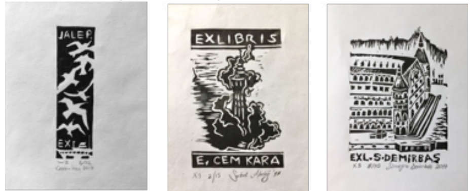
Image 9: Ex-libris of Istanbul belonging to Ceren İren from Ex-libris Workshop, 2017.